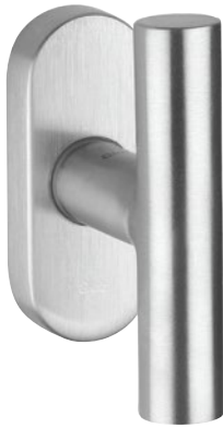
Picture shows handle with 5618C rose